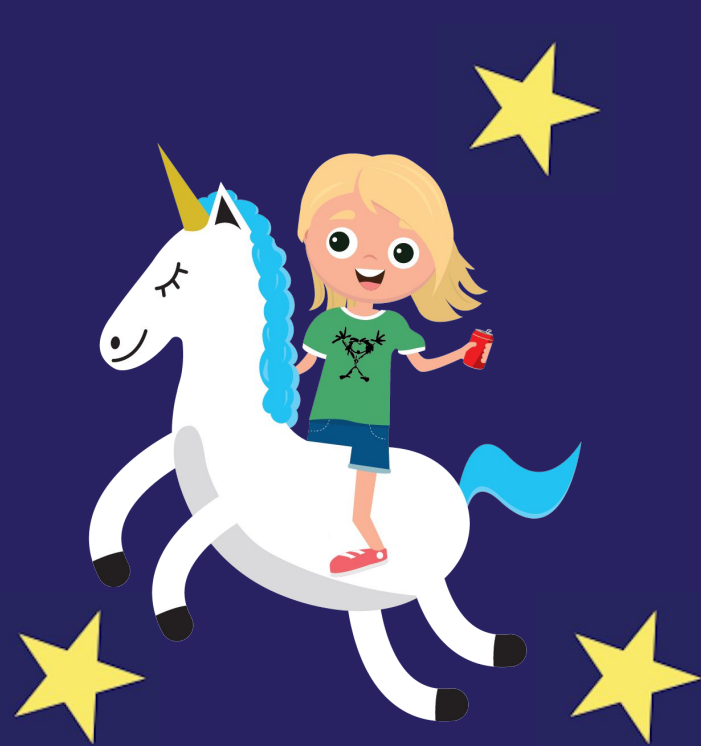
Ellie & Gallium the Unicorn